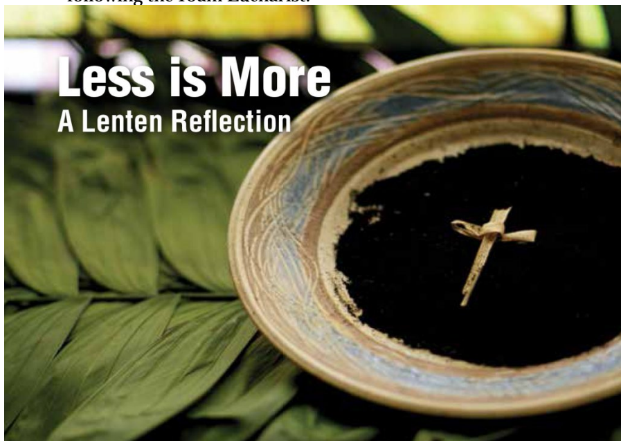
Cover of our Lenten Studies Booklet