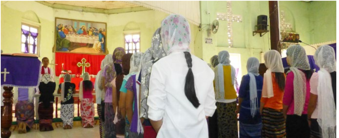
Church service in Toungoo Diocese.

We crave your mercy, Lord, on all who are sick or hungry in Myanmar, remembering especially our sisters and brothers on the staff of the Anglican Province of Myanmar, some of whom who have contracted Covid-19, and others who do not have enough to eat, others made homeless by recent floods. Your Son came to bring fullness of life to all, so we pray for lungs filled with oxygen, bellies filled with food and safe shelter for the homeless so that the people's suffering may be relieved. This we ask in the name of Jesus Christ our Lord who with you and the Holy Spirit lives and reigns for ever and ever. Amen.