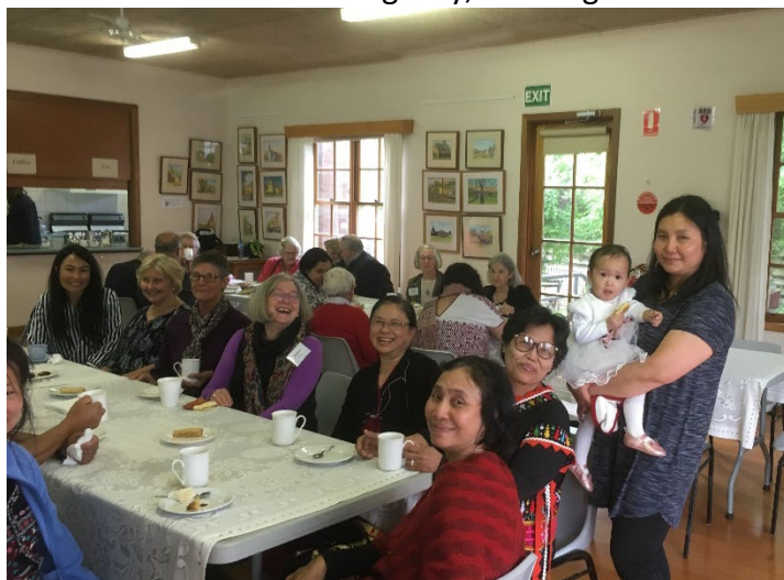
In St James Hall with our friends from St Stephens Karen Anglican Congregation in pre-COVID times. We look for to a time when when we can resume our face to face fellowship.

The situation in Myanmar at the moment for the minority ethnic groups in Shan, Kachin, Karen, and Rakhine States is dire with well documented human rights violations being committed daily by the military. It is a complex business finding ways to deliver benefit to these communities as they hide for their lives and seek to flee to a safer place. The military are known to single out and attack communities who are the recipients of such aid. In the next little while I hope to find a way to give support which doesn't have these repercussions on the very people we are trying help. When I do, I will let you know and put out an appeal for donations. In the meantime, here's some background information on Myanmar from the Anglican Church's national mission agency, The Anglican Board of Mission. ABM-Myanmar