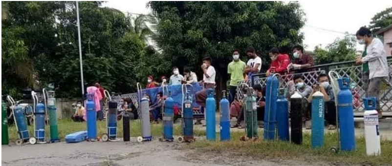
A group of young people has been recruited to bring oxygen tanks from factories for medical use.

I would like to update the name list for requesting prayer.