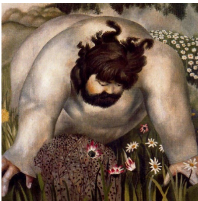
'With the flowers'. Stanley Spencer. from his Christ in the Wilderness series

As usual, Session Five of our 'Forgiveness' Lenten studies began with a time of shared silent meditation. Then we were invited to ponder the photo to the right, 'Bee on Kangaroo Paw', and share our responses. There was the most beautiful and Spirit filled convergence of reflections around how we connect with non-human creation in a life-giving way and how we need to let creation teach us, especially by connecting with first nations people. Clear resonances with this week's Stanley Spencer painting on the left.