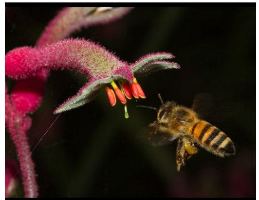
'Bee on Kangaroo Paw'. from our "Forgiveness" Lenten Study Booklet