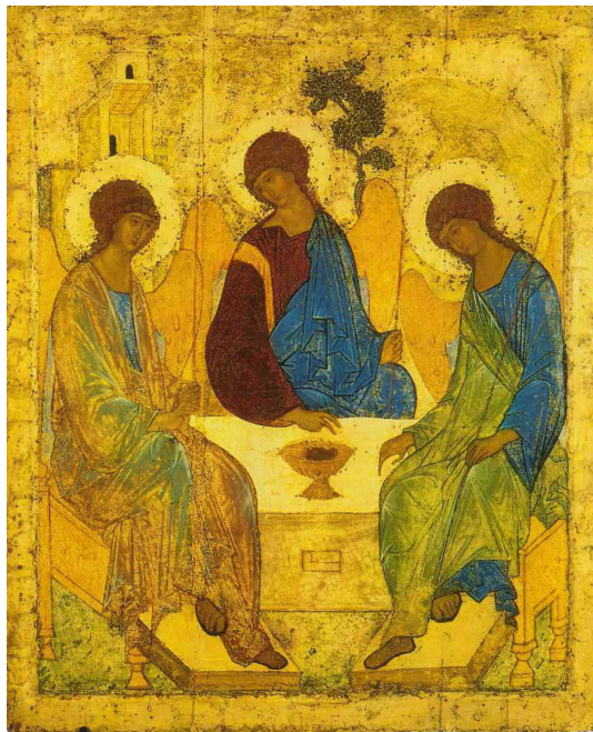
Andrei Rublev 14th Century

Updated – 'Re-imagining the Future' Feb – April 2022